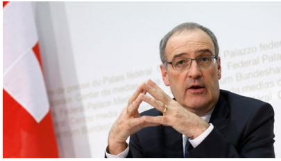
Guy Parmelin, Federal Councillor Head of the Federal Department of Economic Affairs, Education and Research (EAER)

Guy Bernard Parmelin was born in Bursins (Vaud) on 9 November 1959. He holds a federal baccalaureate specialising in Latin and English. Following a farming apprenticeship, he obtained a diploma from the agricultural college at Marcelin in 1979. In 1985, he obtained a Federal PET Diploma in agriculture and winemaking.